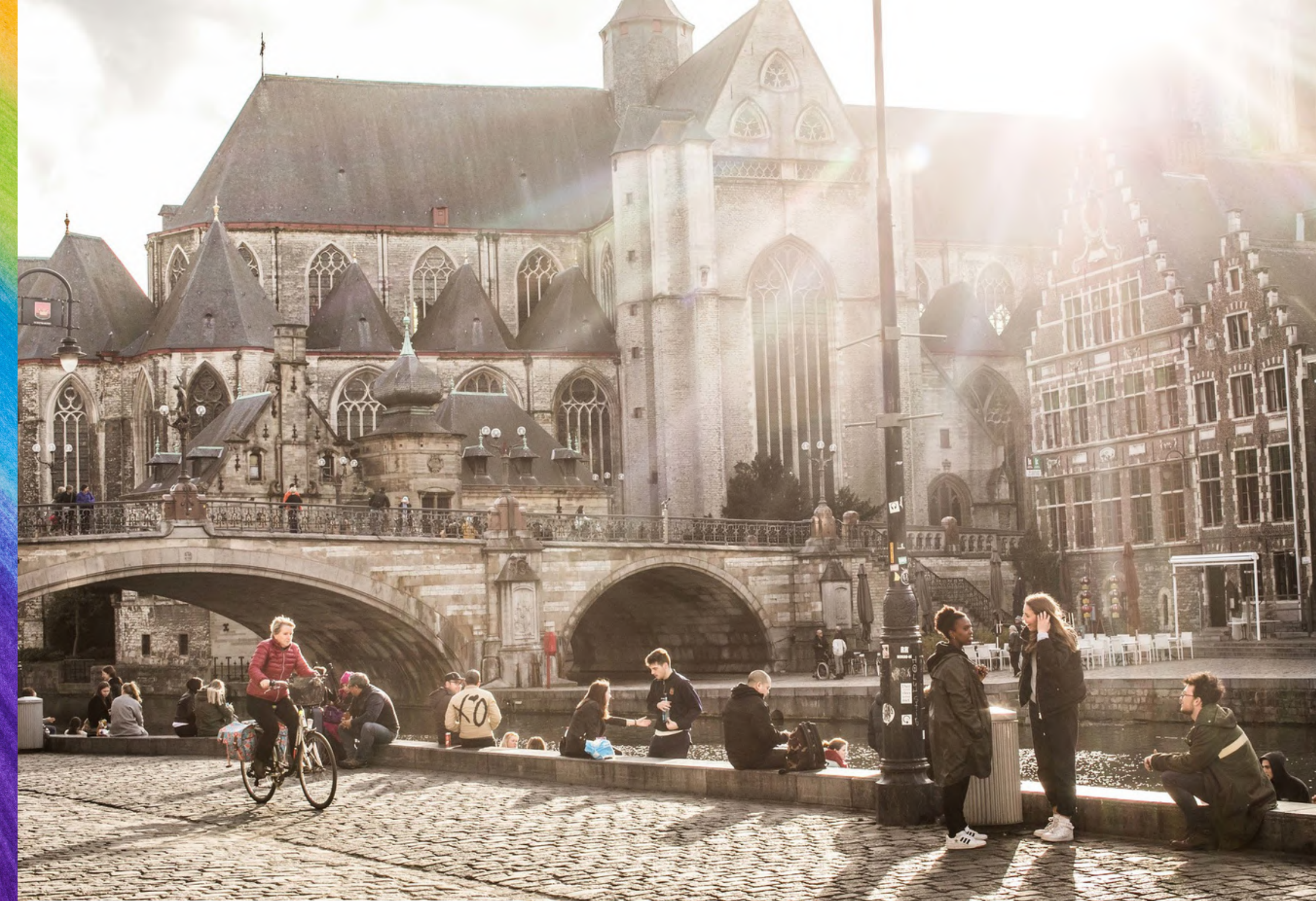
People in the city, with a view on the St. Michael's Church