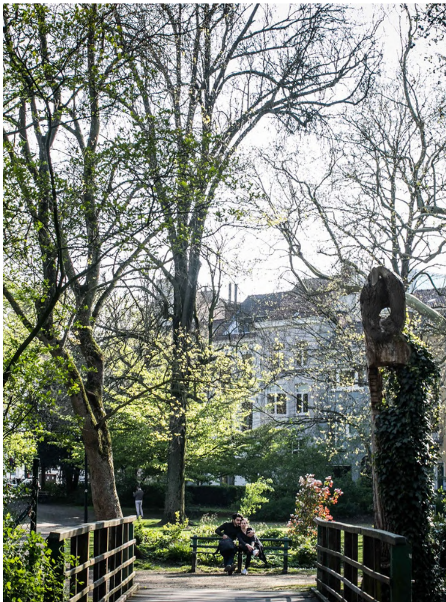
One of the many green hotspots in the middle of the city