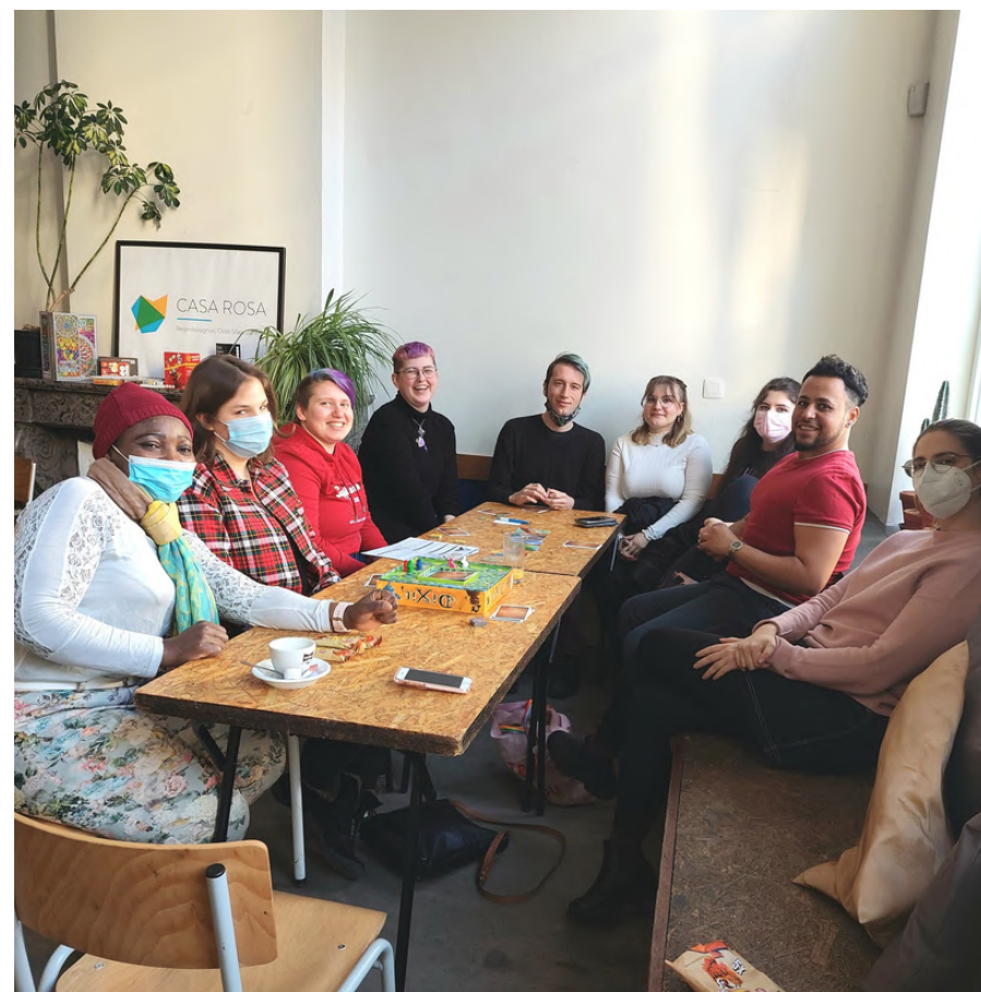
Some of the diverse group of Casa Rosa volunteers during a meeting and games afternoon in February 2022

A seventeenth-century family portrait with the little boys wearing long robes. A large painting depicting the transformation of Hermaphroditus. Scenes with goddess Artemis and her female companions, the oldest portrait of a "man who had a relationship with a man" in the collection. These are just some of the stops on the LGBTI+ museum tour of the Ghent Museum of Fine Arts. We invite you to discover this tour and be inspired.