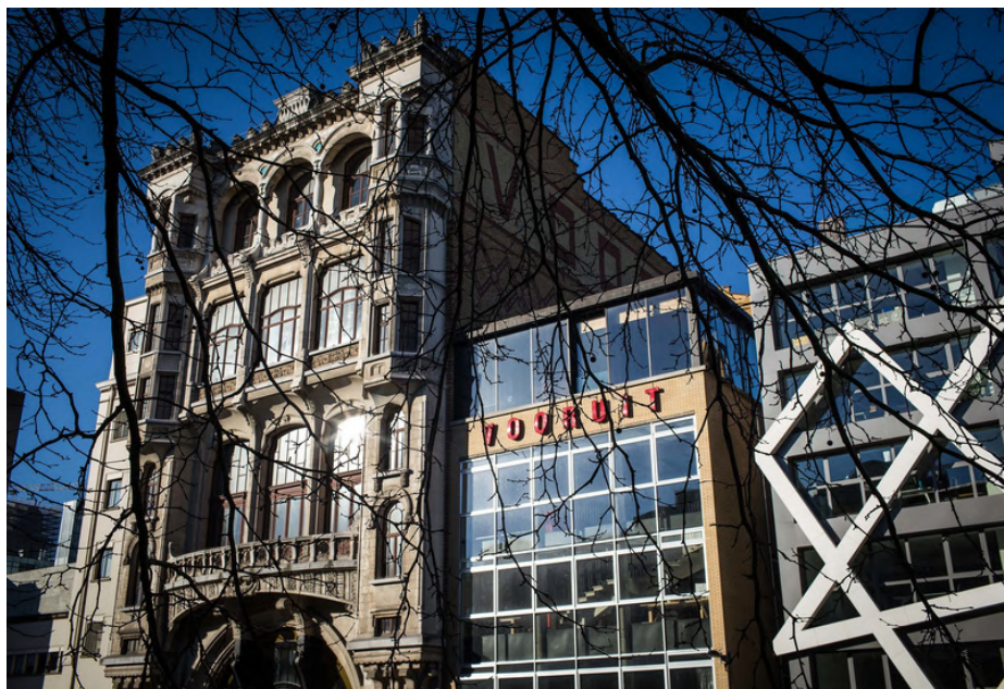
The Vooruit building (both visible buildings)

The Ufo at Ghent University houses a large auditorium. In