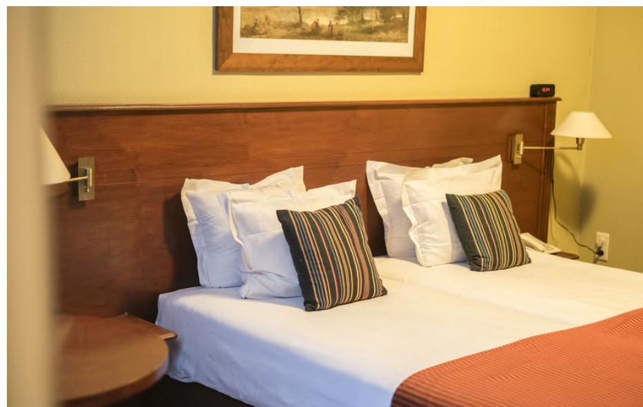
A hotel room in Ghent

By 2022, another 300 new hotel rooms will increase the total hotel capacity to almost 2,750. The city of Ghent is equipped with enough hotel rooms for hosting participants of conferences of this size.