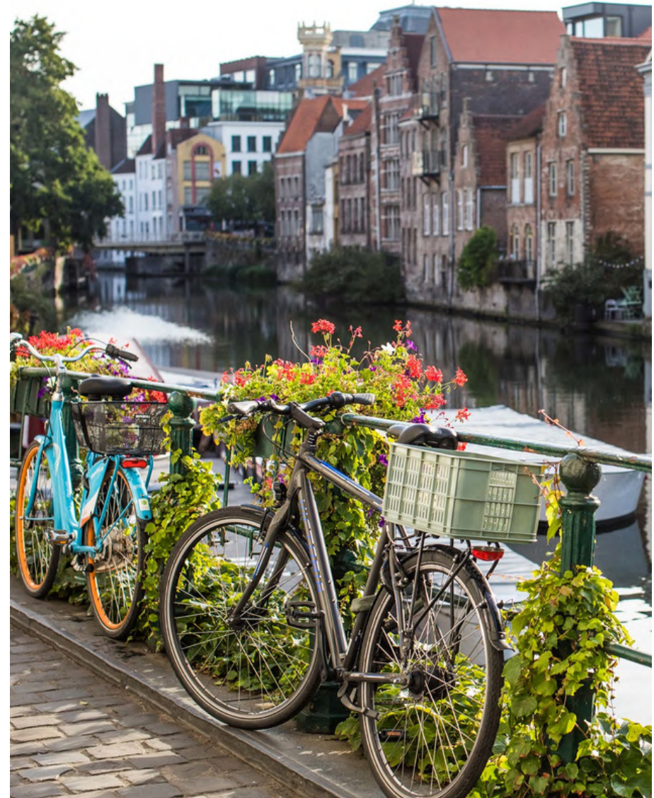
The streams of water and flowers throughout the city - Photo by Bas Bogaerts © Stad Gent – Dienst Toerisme

There's no history of meat-free eating in Belgium. But back in 2009, Ghent became the first city worldwide to adopt a weekly vegetarian day. The local government recognized the health and environmental benefits of a vegetarian diet and mandated that all Ghent restaurants offer at least one vegetarian menu item. Nowadays, the city has more vegetarian restaurants per capita than most cities.