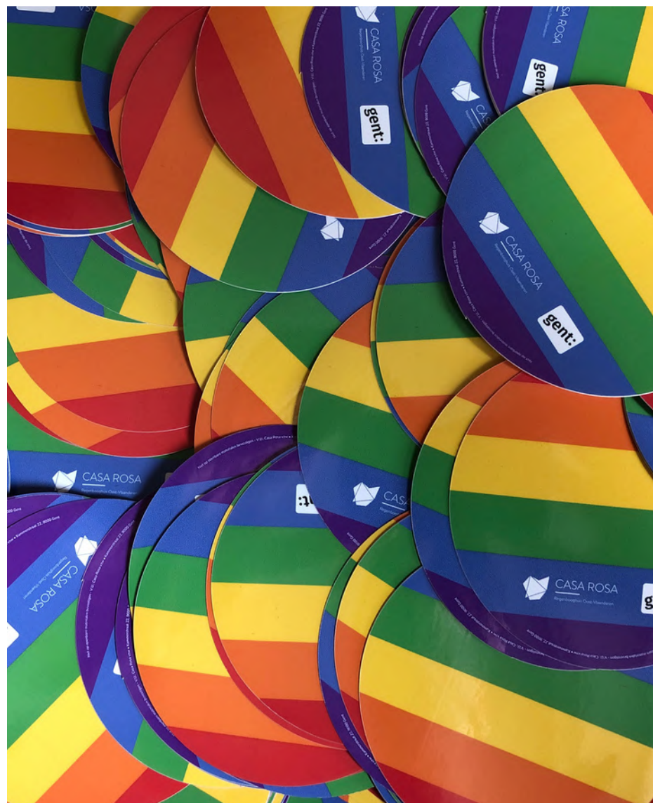
Rainbow stickers for a campaign of Casa Rosa, supported by the city of Ghent

About 150 local associations are involved with the umbrellas and rainbowhouses (discover them all via cavaria.be/associations , arcenciel-wallonie.be/nos-associations , and arcenciel-wallonie.be/maisons-arc-en-ciel ). Of course, we want to work closely together with these and many other (inter)national organizations and partners who share their experiences, expertise, and drive to organize a strong and impactful ILGA World Conference in Ghent.