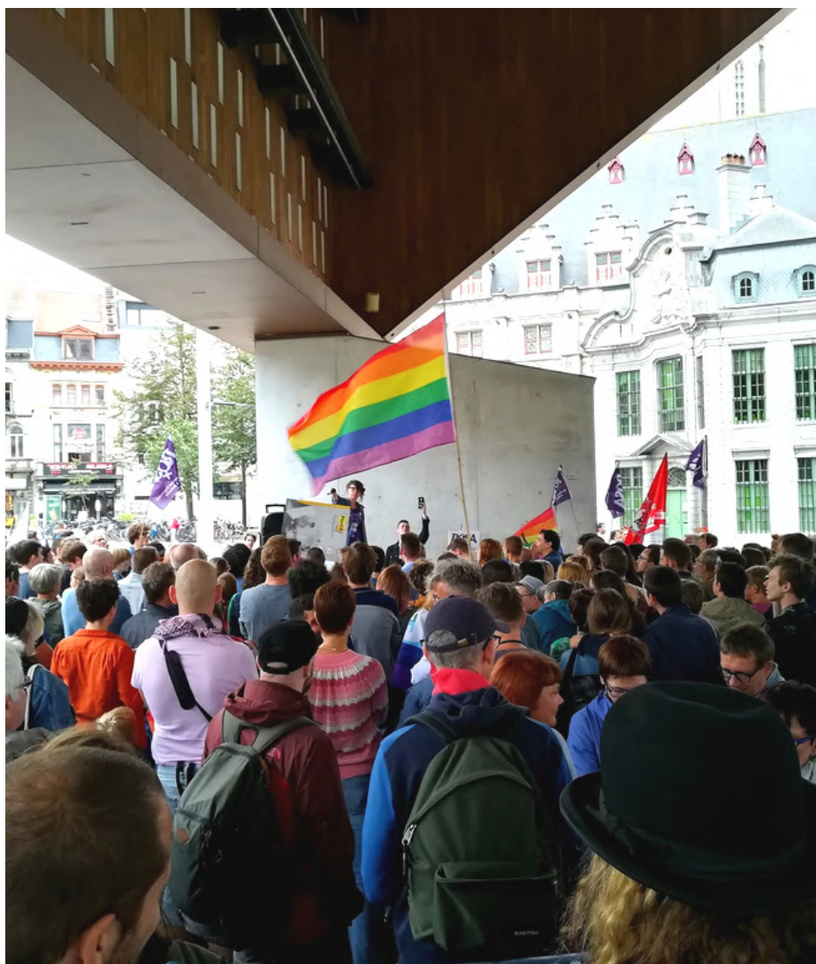
Manifestation in Ghent against violence, discrimination, and racism